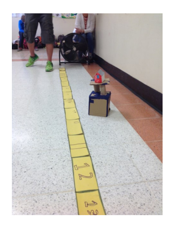
More STEM in action: Testing the power of wind in Mr. Chiu's science class!