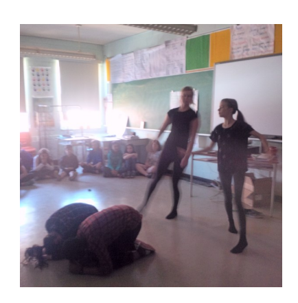
Some very thought-provoking dance in Mme Panucci's class dealing with subjects like bullying.