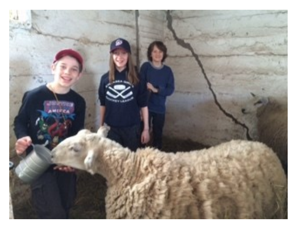
Outdoor Ed with the Grade 6's at Sheldon!