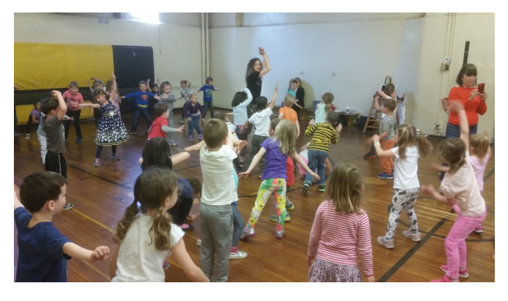
Students in Kindergarten to Grade 3 had a blast at the Groove Dance workshop!