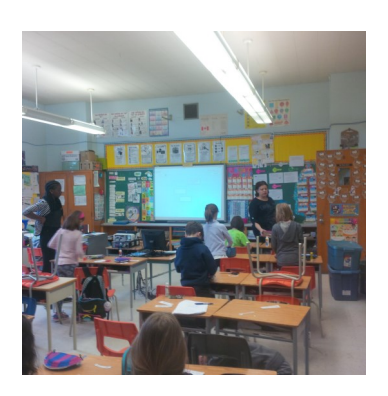
Mme Bacalu's class is using the Poplet app in their Literacy program—integrating STEM into language!