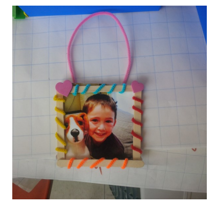
Mme Le Bouedec and Mme McCowan created lovely Mother's Day Gifts!