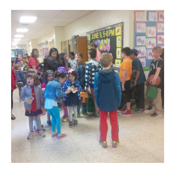
When the call goes out, you can count on the community at Humbercrest to respond. We raised several hundred dollars in a one day bake sale to help the people of Fort McMurray, Alberta recover from that devastating wildfire that scorched the city.