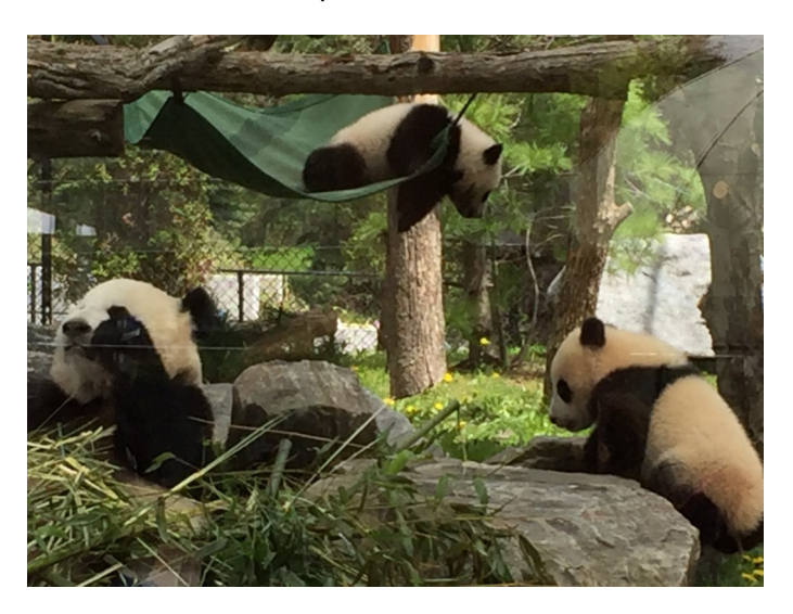
It was 'panda-monium at the Zoo!