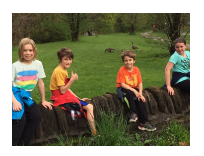
Taking a break from training for the Family 5K Run this month